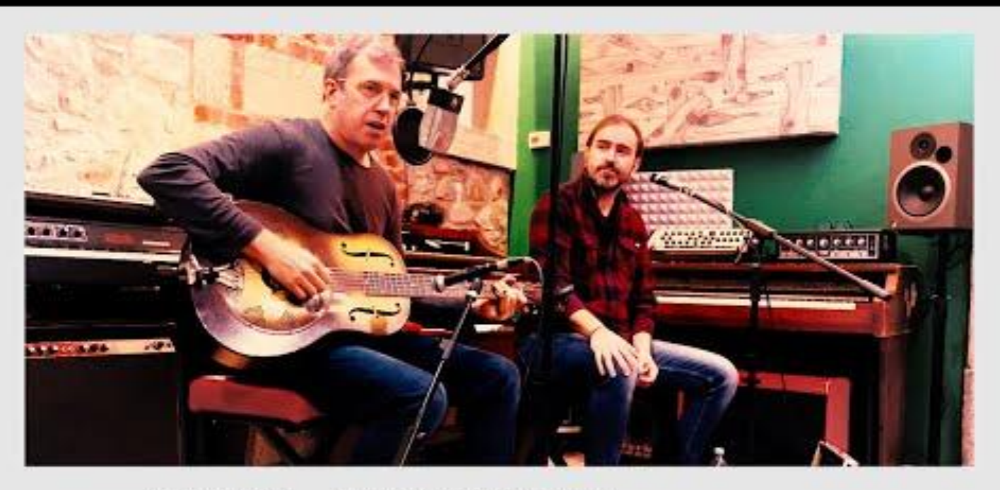
TIPITNA - NORTH OF THE SEA THE NEW ALBUM BY MANLIS MILAZZI + JJ APPLETON